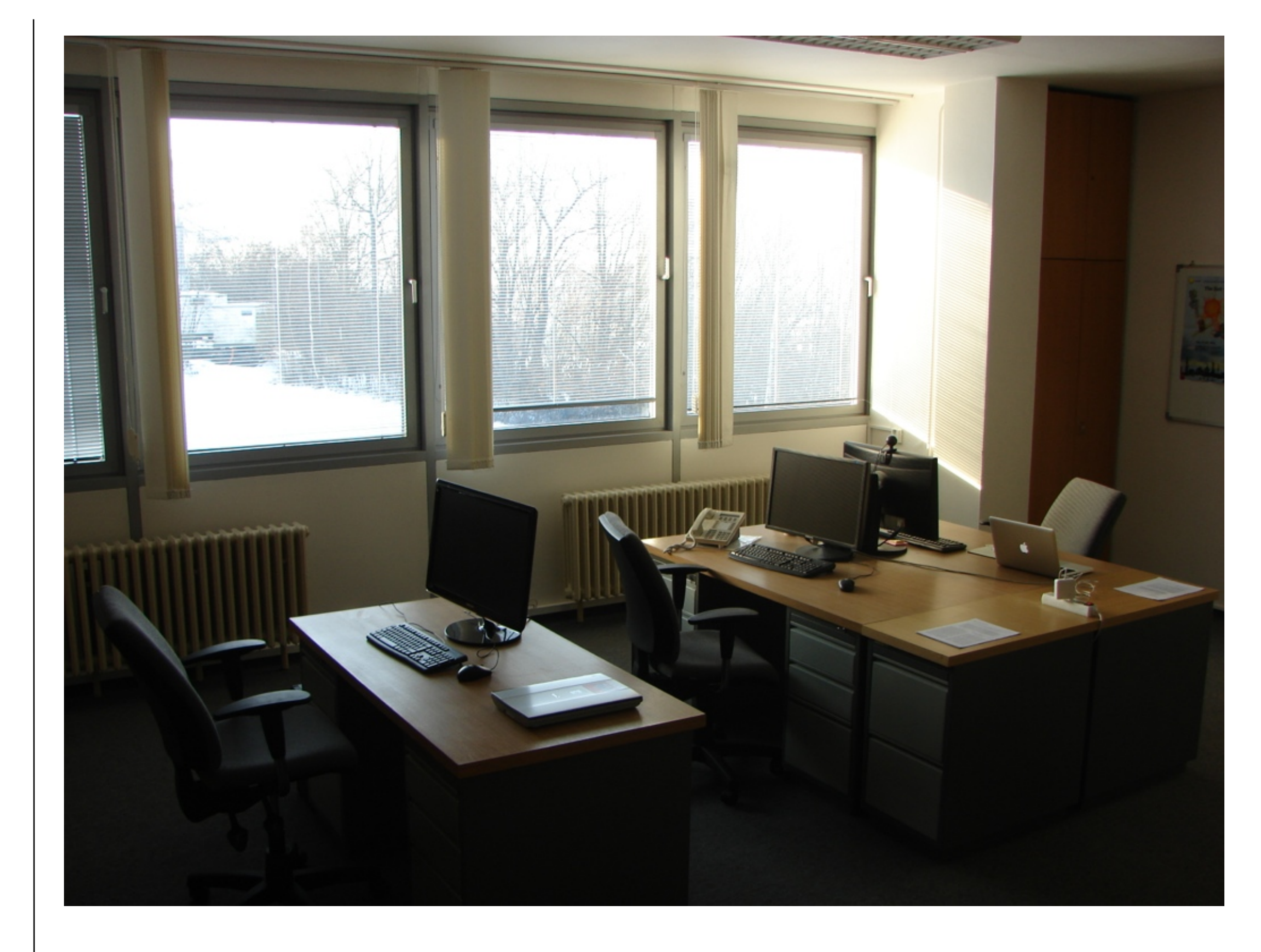
Czech ALMA Node